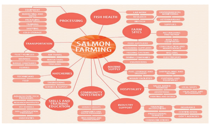
FIGURE 3. The social-ecological ecosystem of Atlantic salmon farming (International Salmon Farmers Association 2018).

as much as possible, other aquaculture service industries that produce the most benefits to local economies. Investing in local institutions and employing local professionals as well as importing highly paid professionals from the outside are vitally important, especially for rural development. In Scotland, salmon aquaculture contributes to the long-term viability of many rural, coastal and island areas with year-round,