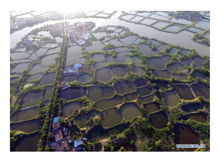
FIGURE 1. The Zhejiang Huzhou Mulberry-Silkworm-Fish Pond Aquaculture Ecosystem in China is estimated to be more than 2500 years old, existing to today. It has been designated by the FAO as a "Globally Important Agricultural Heritage System."

Ecological aquaculture is an alternative model of aquaculture development that uses ecological principles and practices as the paradigm for development of aquaculture systems (Costa-Pierce 2002, 2003, 2013). Ecological aquaculture farming practices celebrated in this field are not